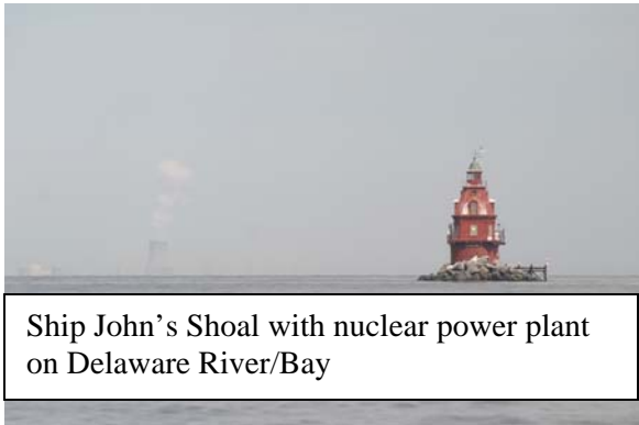
Ship John's Shoal with nuclear power plant on Delaware River/Bay