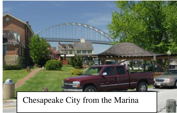
Chesapeake City from the Marina

Friday morning started with NE winds of six kts. Hoisted the sails and the anchor. The winds built to 10-15 knots and the beat of 25+ nm to Back Creek at the entrance of the C&D canal could not have been better. We maintained boat speeds in the 7 kts range throughout using our cruising sails! Docked free at Chesapeake City Dock around 2 p.m. Wandered the very nice, quaint, friendly town of 2 x 3 blocks long and then settled in for dinner and drinks at the Chesapeake Marina and Inn overlooking the harbor.